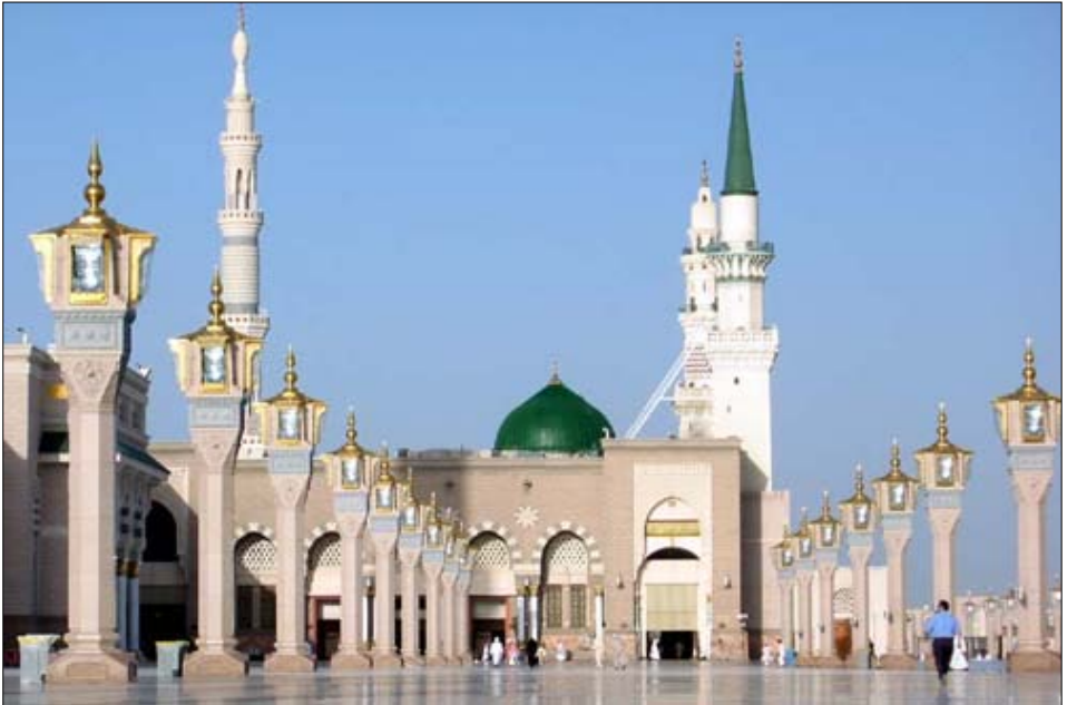
Holy Prophet Muhammad (pbuh) Mosque, Madina